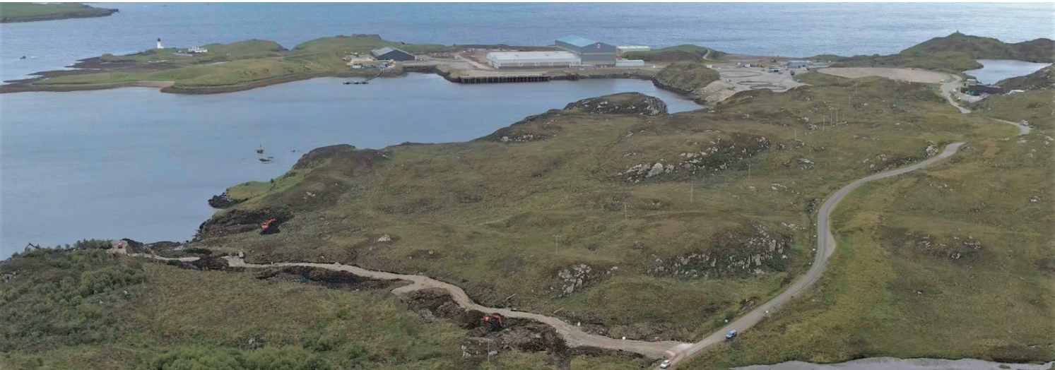
Aerial view of new Access Road construction in progress (Arnish Point in the background)