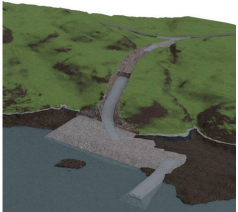
Diagram showing access road and rock bund

The Harbour Master has issued a Notice to Mariners directing vessels to keep away from the works area. Yellow marker buoys will be installed as an additional precaution.