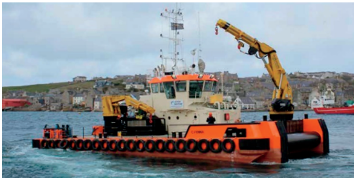
MV C-Fenna, one of the vessels that will be carrying out works to the wrecks

Work to reduce the height of the SS Alabama will also be carried out. The wreck removal company will liaise closely with the Harbour Master to avoid any impact on vessel traffic.