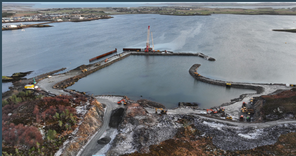
Rock platforms and quay walls as of 17th December