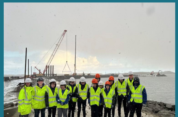
S2 pupils on their second site visit

To complete the programme, they visited the DWT site in December to see how work had progressed since their last visit in October.