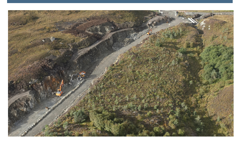
New access road looking South

Rock has been removed to form a new access road from Arnish Road down to the new terminal. This is a major milestone for the project. The road will be used to transport construction machinery materials for the quay walls down to the work area.