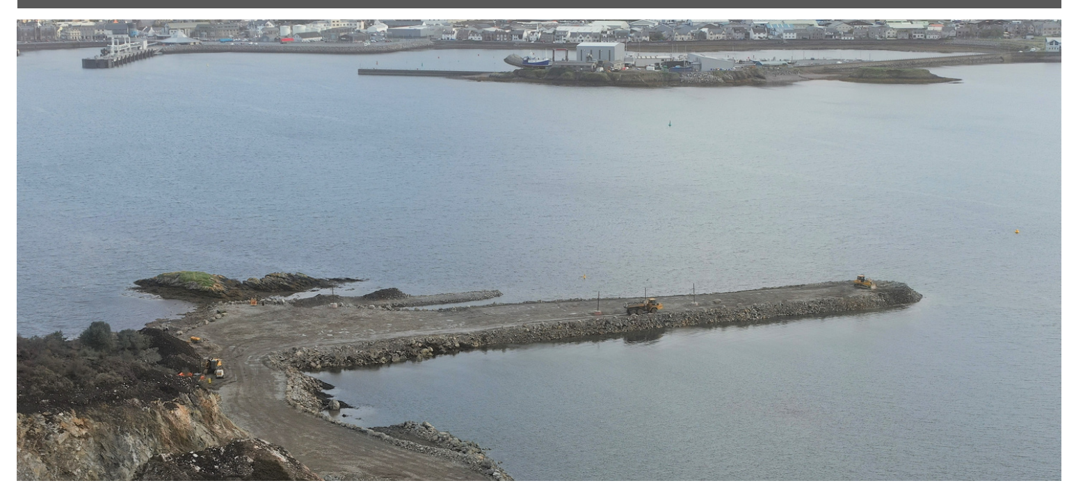
The rock platform along the north edge of the reclamation area

On 31 August there was an incident in the port that resulted in the tragic fatality of a McLaughlin & Harvey subcontractor. Our thoughts and condolences are with their family. The Port Authority and McLaughlin & Harvey are working to provide support to all affected. An investigation is underway, and we are continuing to liaise with our partners and the relevant authorities.