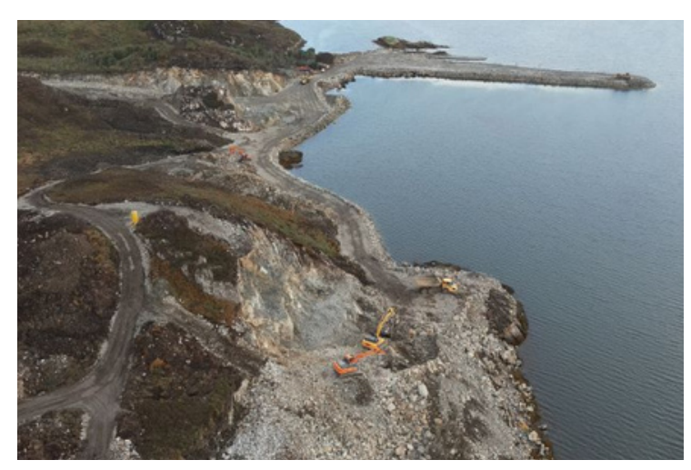
Blasting and movement of rock will continue in October