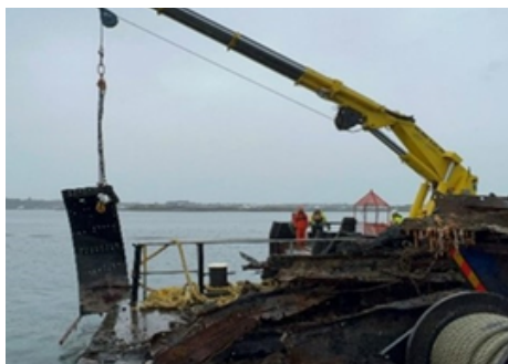
Remains of the wreck Portugal