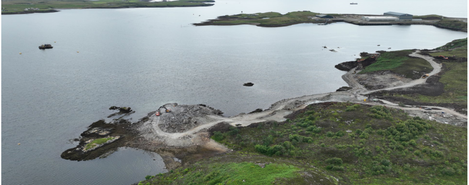
Aerial view of the works at the end of July